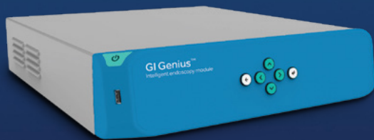
GI Genius™ intelligent endoscopy module

Enhance your ability to detect colorectal cancer with Artificial Intelligence (AI).